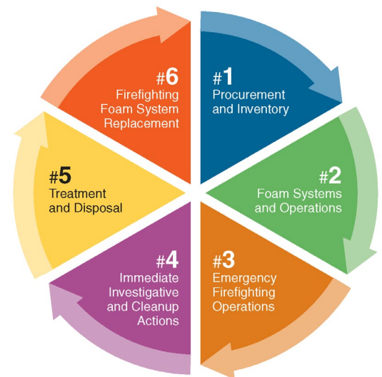
Figure 3. Life cycle considerations for AFFF.

Firefighting foam replacement is complex and could require a complete system review and, potentially, redesign and modification of system components to meet the new objectives or material and performance requirements. Foam replacement should include an evaluation of specific hazards and application objectives, a review of applicable performance standards, an understanding of engineering requirements for foam product storage and application, and a check to ensure that the foam product is approved for use for the specific hazards being mitigated.