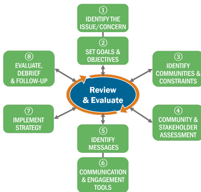
Figure 2. Risk Communication Plan Process Diagram

We do it with a risk communication planning process. This risk communication planning process, was adapted from the work of NJDEP (2014) which relied on the work of Caron Chess, Billie Jo Hance, and Peter Sandman, Environmental Communication Research Program, Cook College, Rutgers University, as published by the New Jersey Department of Environmental Protection. Figure 2 illustrates the communication plan process. At the center of the diagram is 'review and evaluate', representing communication as two-way, ongoing and continuous, and includes reviewing and evaluating progress. The following subsections summarize risk communication and public outreach tools with PFAS-specific examples that align with the risk communication planning process steps 2 through 6. More information is included in the Risk Communication Toolkit.